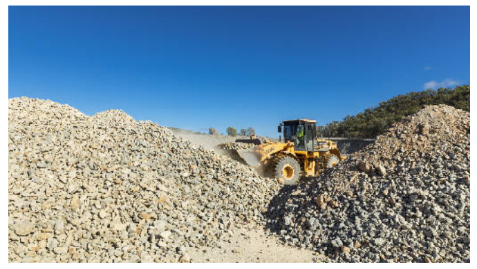
Figure 4 - Quarry product stockpiles

The quarry operations team has taken the opportunity during the rainy season, to implement the upgrade of several pieces of equipment, complete larger repair and maintenance jobs as well as upgrade both the high