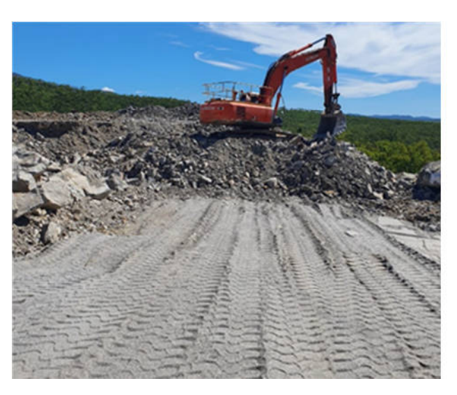
Figure 1 - Stockpile truck loading ramp

The XRT Sorter Plant (XRT Sorter) was operated over the period and saw over 18,000 tonnes of feed material tested through the sorting plant from various pits and excavations around the mineralised stockpile. Samples have been extracted from these test pits, trenches throughout each production thereafter, which have been sent to Australian Laboratory Services (ALS) and to the University of Queensland for analysis. The results of which are being used to inform the ongoing test program under METS Ignited as well as the ongoing feasibility study work. Some of the challenges experienced during the quarter related to wet primary material due to the heavy rains leading to slower throughputs, however, with the wet season coming to an end, production rates will continue to increase.