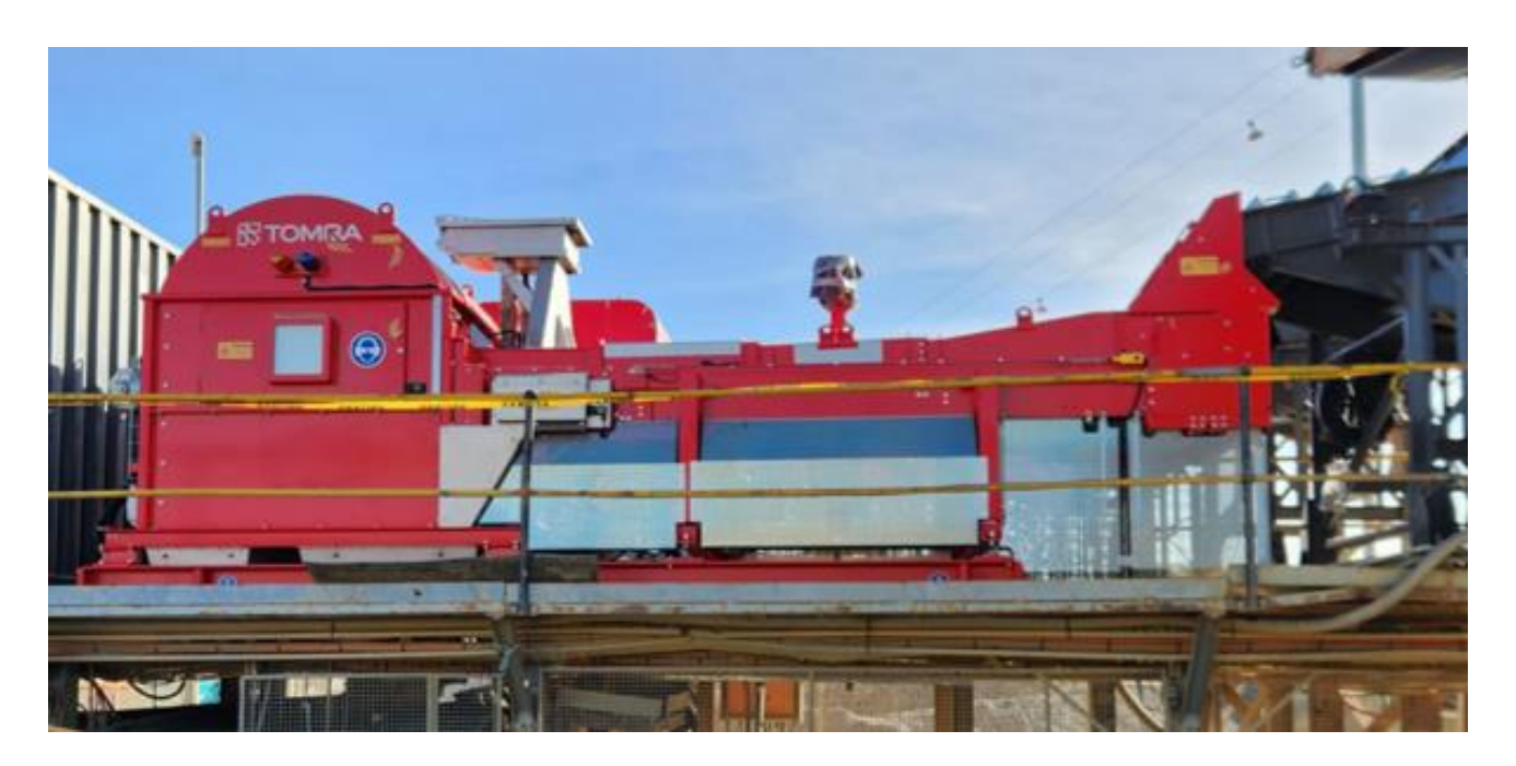
Fig.3 - Current XRT Sorter unit at Mt Carbine (two in operation, one under refurbishment)

The additional unit and respective upgrades will boost sorting capacity by more than 100% to treating fresh ore from the Andy White Open Pit and Low-Grade Stockpile material at Mt Carbine, in line with the recently announced plan of the Company to double overall processing capacity by the end of 2024 (see ASX announcement "Mt Carbine Receives Additional Equipment For Doubling Of Throughput Capacity" dated 20 March 2024). The new generation XRT Sorter is expected to be delivered before the end of Q4FY2024, while the refurbished XRT Sorters should be operational soon after.