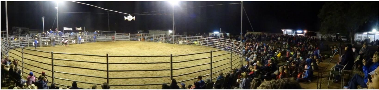
Figure 3: Rodeo Night- A Spectacular Gathering of 2000 Strong Community Spirits, Sponsored by EQ Resources and Golding. Celebrating Unity, Fun, and Giving Back.