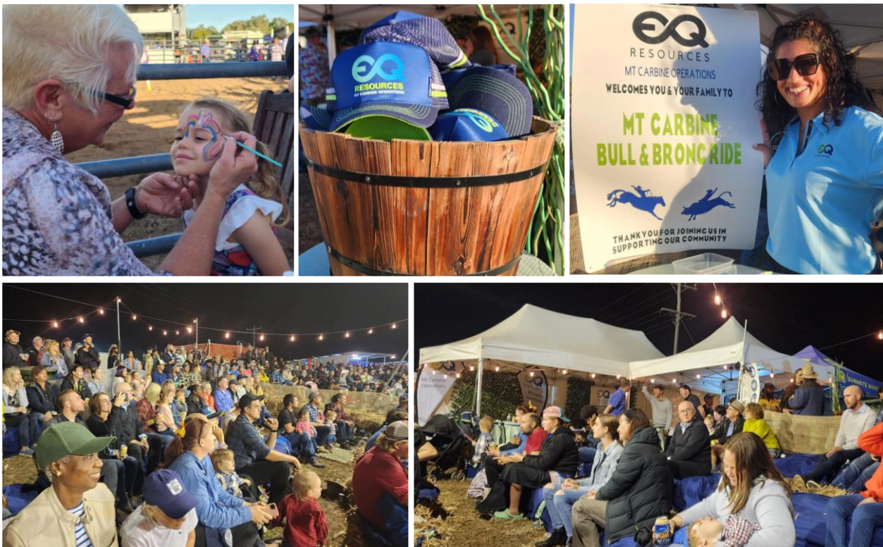
Figure 4: Community Connection Under the Hospitality Tent- EQR Families Bonding, Building Stronger Teams, and Creating Lasting Memories.

In addition to its financial support, EQ Resources leverages the Mt Carbine Annual Rodeo as an opportunity to foster deeper connections with its employees and their families. EQR hosts them in a dedicated hospitality tent during the event. This initiative serves multiple purposes. Firstly, it strengthens EQR's presence and awareness as a caring employer within the community. Secondly, it creates a unique platform for team-building among employees and offers their families a chance to get to know one another better. This social interaction not only contributes to a sense of belonging but also positively impacts the mental well-being of EQR's workforce. It underscores EQR's commitment to not only the success of its mining operations but also the overall health and happiness of its employees and their families, aligning with a holistic approach to community engagement and support.