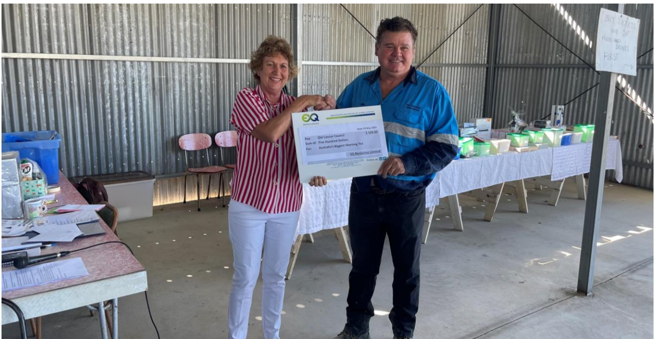
Figure 2: Sipping Tea for a Purpose- Cancer Council's Australia's Biggest Morning Tea Brews Hope at Mt Carbine Rodeo Grounds

The Mt Carbine Rodeo Association doesn't just host a fun-filled event; it uses this platform to support charitable causes. For example, one recent fundraising event focused on Australia's Biggest Morning Tea, raising funds for Cancer Council Queensland. EQR, true to its ethos of responsible corporate citizenship, proudly supports such initiatives. The sponsorship of the rodeo is not just about financial backing but also about actively participating in raising awareness and funds for causes that matter to the community.