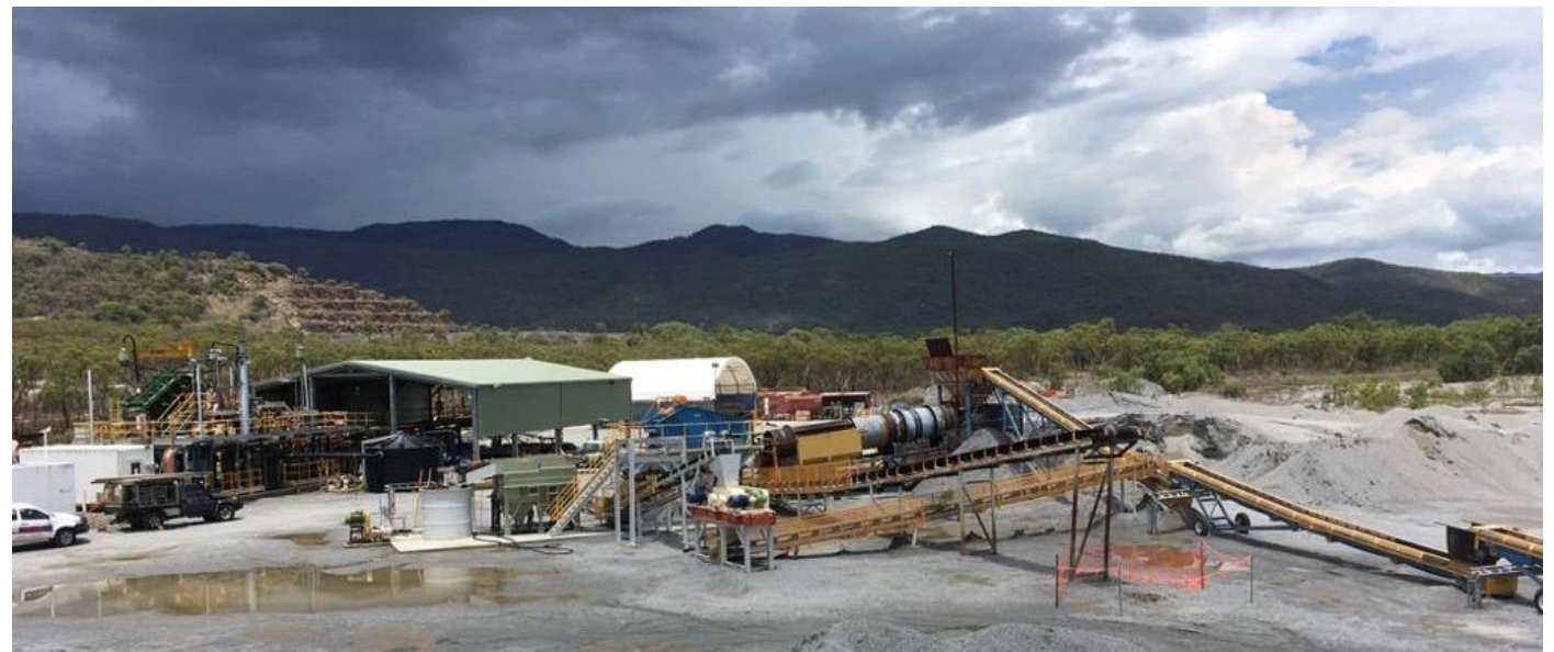
View of the commissioning of the Retreatment Plant (raw material intake at front right; screening, crushing and jigging at center front; gravity circuit under shed).