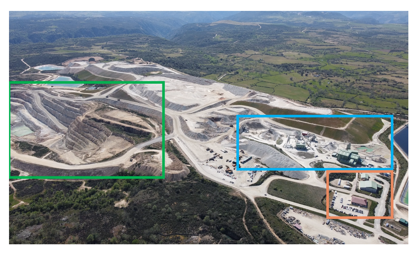
Fig.2 - Barruecopardo Site: In Green shown the mining operation, in Blue shown the crushing & screening circuits and main processing plant; in Orange shown the laboratory and administration building

back online in early 2019 leveraging modern technology after nearly 40 years of shutdown. Mining and concentrating activities at the mine are designed to minimise any environmental impact while ensuring a high mineral recovery. Current production is approximately 140 tons/month of high-grade (>65% WO<sub>3</sub>) tungsten concentrate, with various minor plant expansion projects ongoing for higher recovery and throughput.