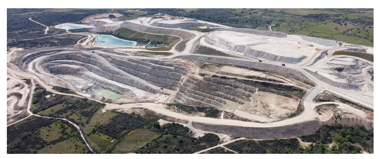
Fig.4 - Aerial view of the Barruecopardo open pit (as of July 2023)

The Barruecopardo Mine is a tungsten deposit with Scheelite (CaWO<sub>4</sub>) as the main tungsten bearing mineral and the deposit type being vein and sheeted vein coarse (nuggety) scheelite mineralisation style. Within the pit area, mineralisation forms a main approximate 30 metre wide envelope of sub-vertical-steep east dipping veins. The pit accommodates the intersection of two main sub-divisions, being a main north trending mainly scheelite mineralised zone and a second north-northwest trending scheelite plus wolframite mineralised zone.