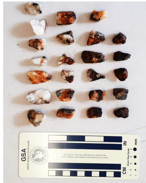
Figure 2 - XRT Sorter Product with high-grade wolframite particles

At the start of September, additional staff were appointed to site operations to operate the XRT Sorting Pilot Plant and to conduct the bulk test work as material is made available for processing. This will allow the sorting test work to take place without any disruptions to ongoing production activities for the quarry and tailings retreatment operation.